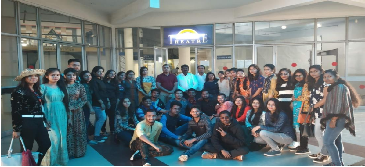
Industrial/Educational/Study Tour to Gangtok and Darjiling